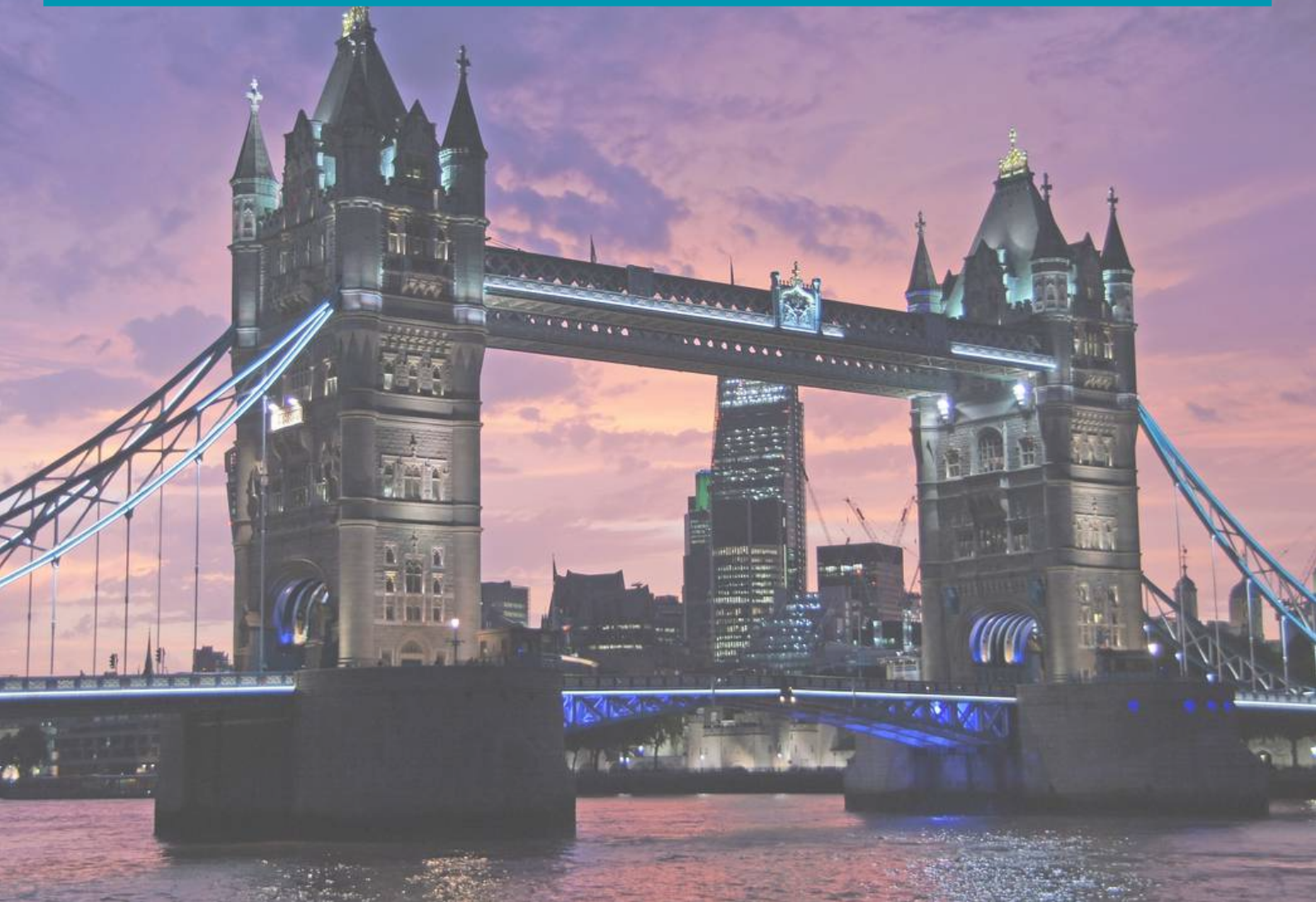
EXHIBIT @ OGPE 2024