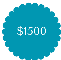
Table top (Approx. 3M table top exhibition stands, including 1 complimentary exhibition pass)

Shell Scheme (3X3M, including complimentary registration for 1 delegate)