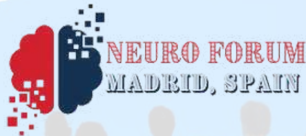
EXHIBIT @ Neuro Forum-2024